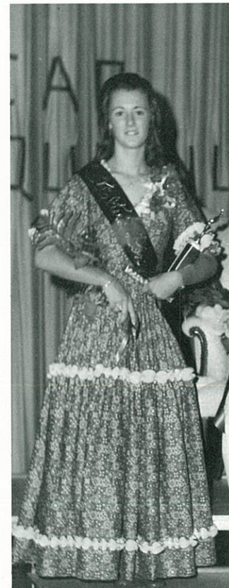
Almost made it.