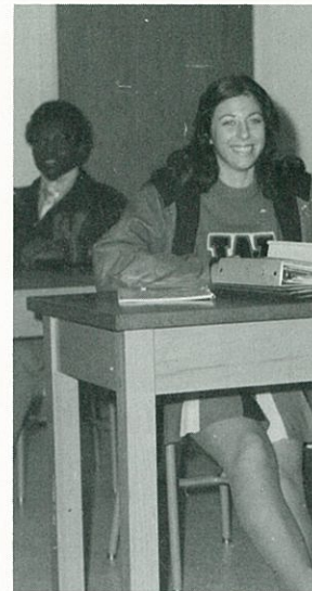
Wanna walk a mile in my shoes???