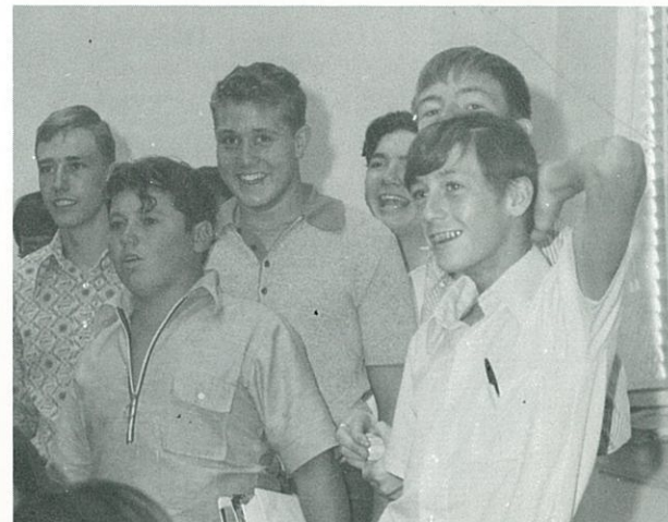
I didn't use deodorant today and I may not use it tomorrow.